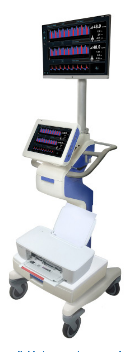
Available in EU and Japan Only