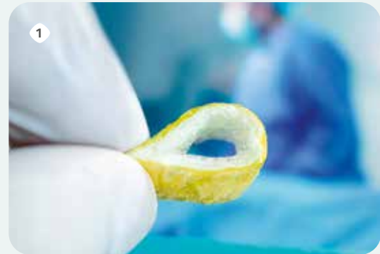
Freely formable in dry state