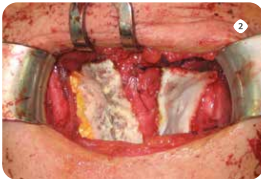
Excellent visibility in the surgical field